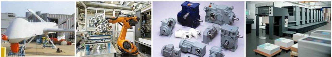
Unmanned Aerial Vehicle